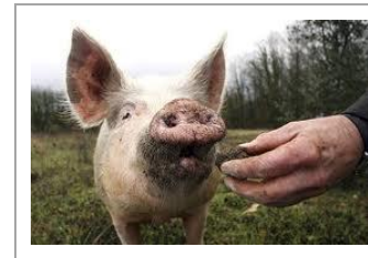
'Yum Yum 😊

Traditionally truffles were located with the aid of a pig that tended to eat most of the prized fungus. These days' commercial truffle farms use trained dogs, as they are more efficient and successful truffle hunters.